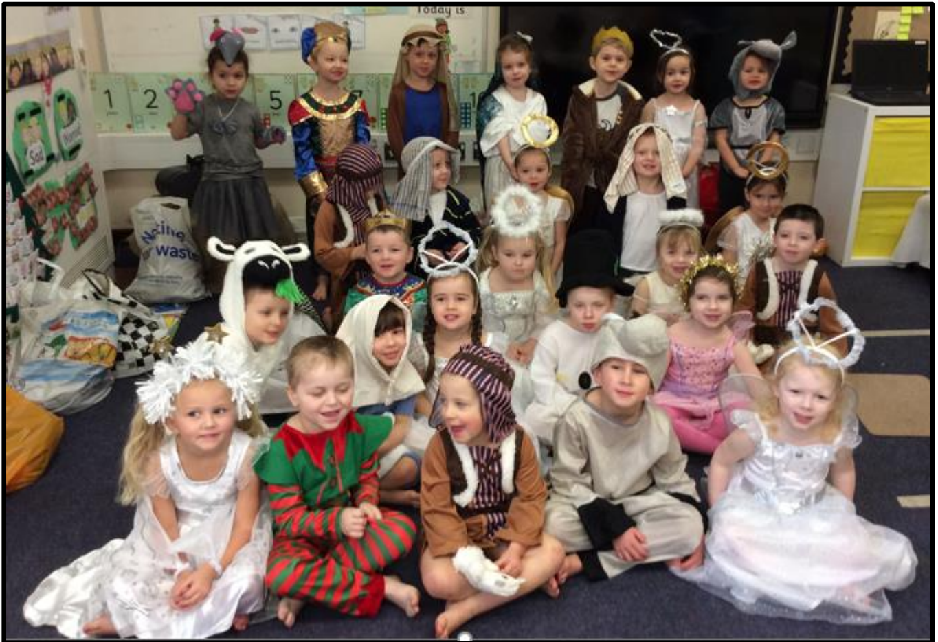
Class 6 Nativity Carol Concert