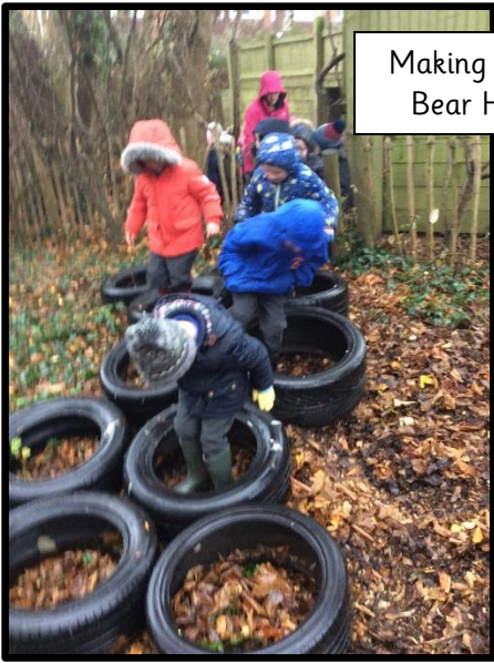
Making up our own Bear Hunt Story